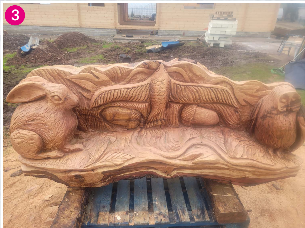
Potential for carved wooden bench made by tree trunk already on site.