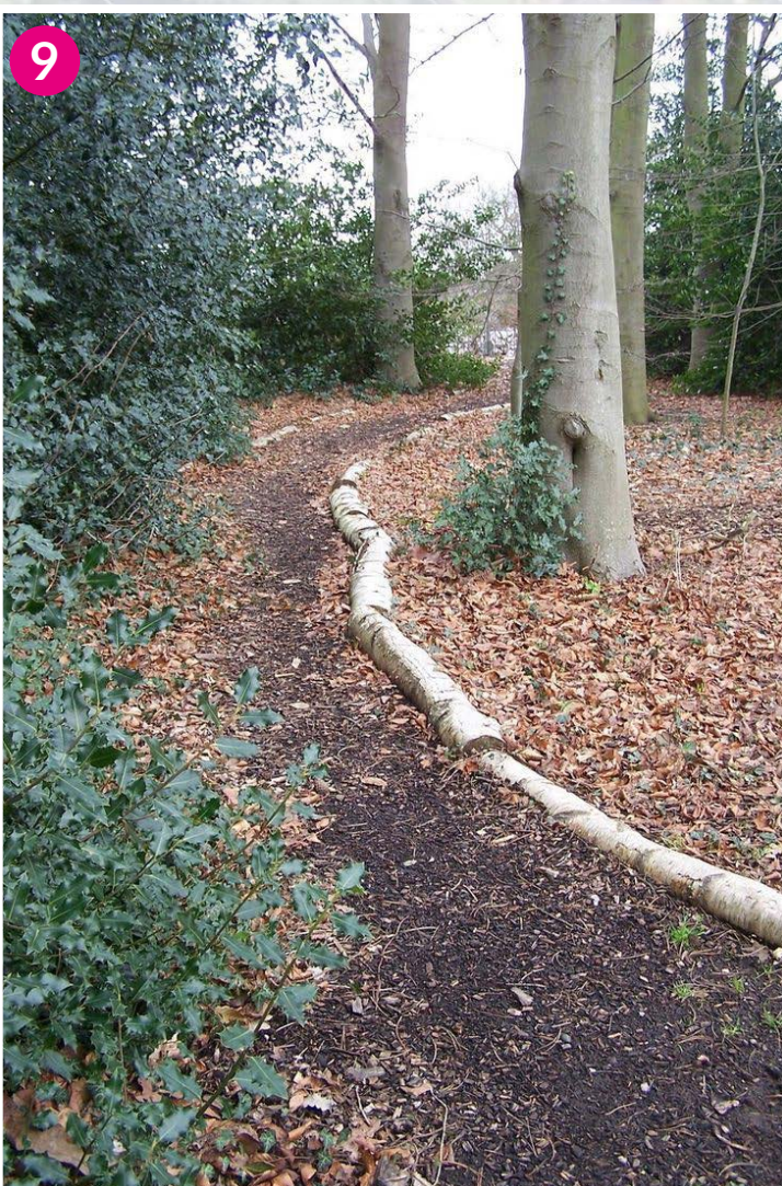
Recycled timber logs placed along path to prevent encroachment.