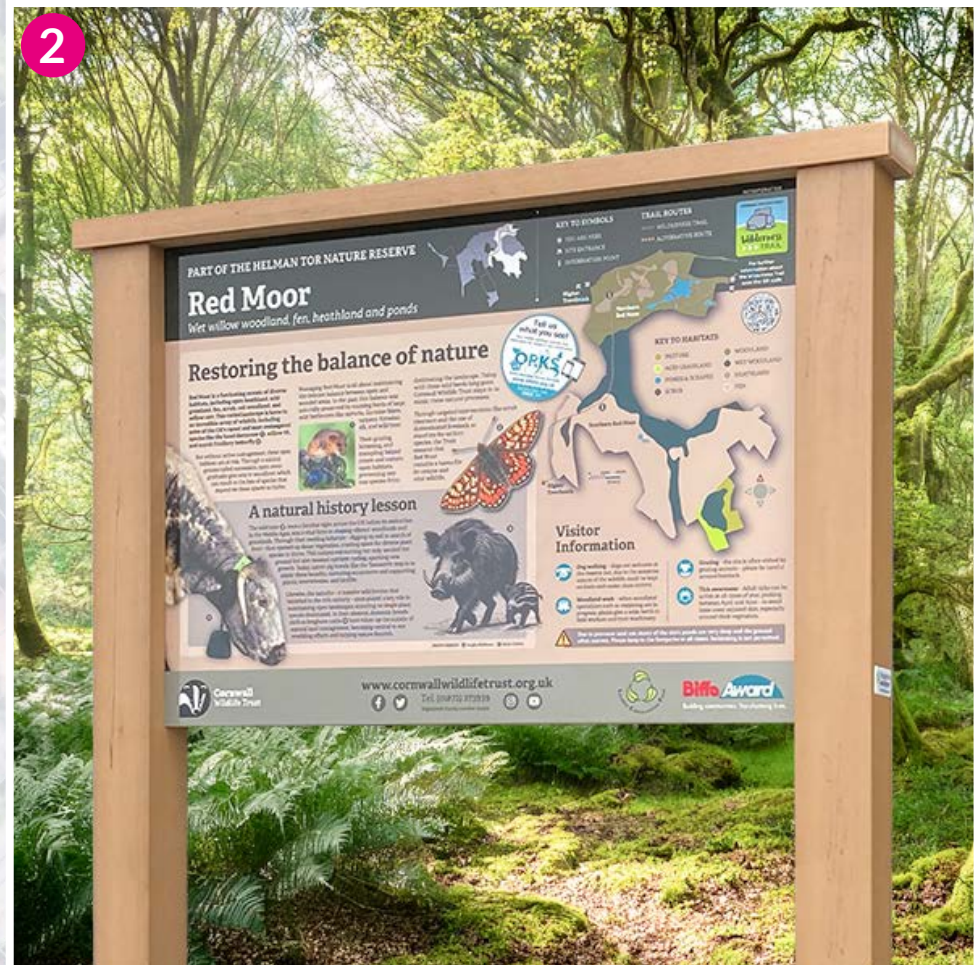
Potential for lecterns and welcome boards informing visitors of key features including flora, fauna and history, and of FOGW events in the wood.