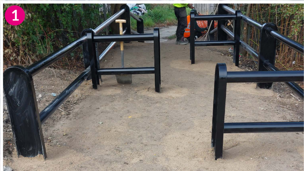
Chicanes to be placed at entrances and to replace some bollards to prevent/slow down quad bikes and dirt bikes.