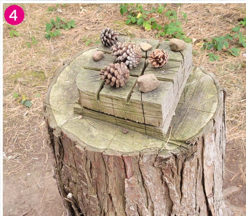
Use existing logs for games and sculptures to create a trail around the woods to entertain younger visitors.