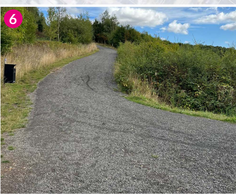
Paths to be converted to HopPath (or similar approved) to create parameter circuit paths.