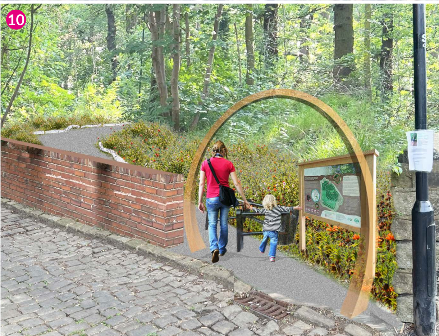
Potential for new entrance with arch feature, connecting path surfaced with HopPath (or similar approved), and wildflowers and bulbs making it more colourful and biodiverse.