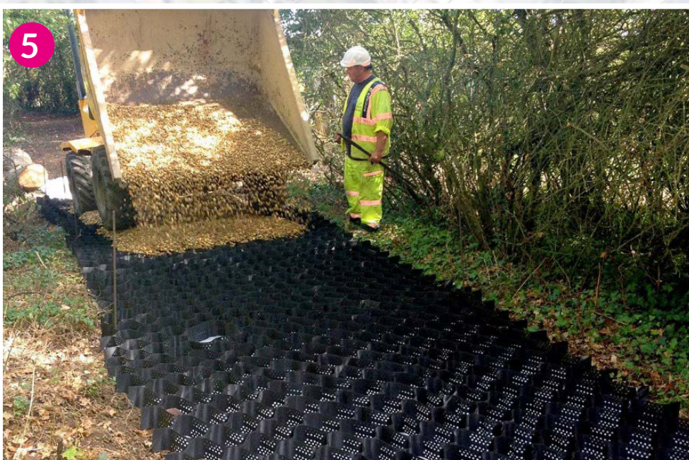
Suggested use of GeoWeb around trees.

Transform old sub-station base to create picnic site and plant Hawthorn hedge to back.