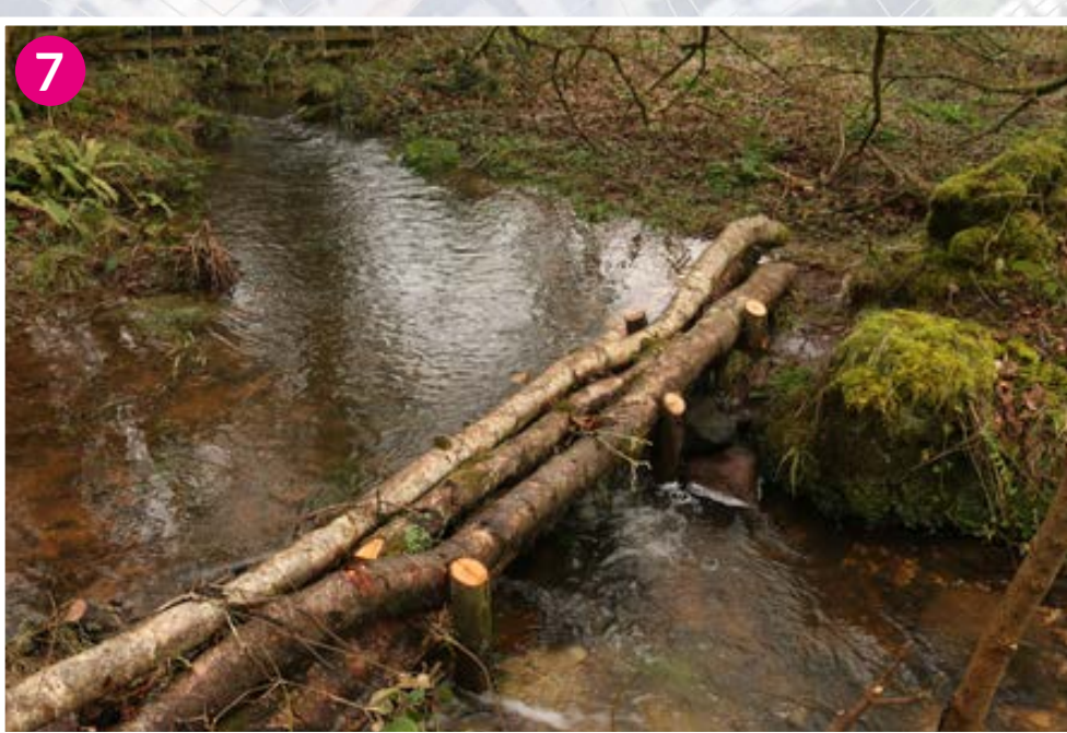
Possible water retention method such as leaky dams.